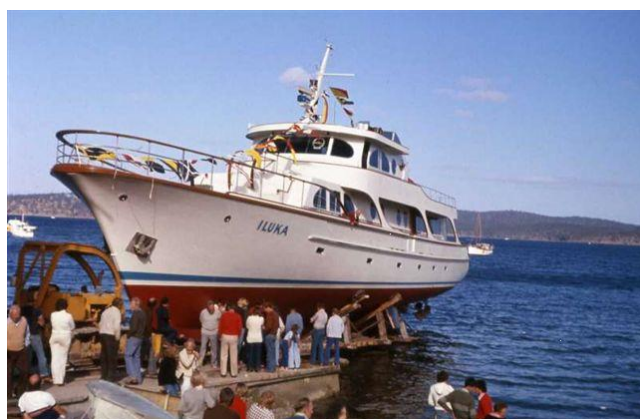
Iluka at her launch in 1970