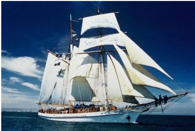
One and All

For more information about these exciting adventures, including voyage dates, visit www.oneandall.com.au and follow the link or telephone the One and All office on 08 8341 2004.