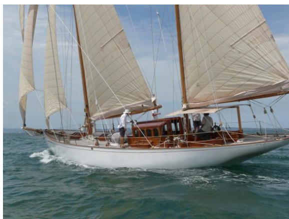
Hurrica V will feature at the 2011 festival