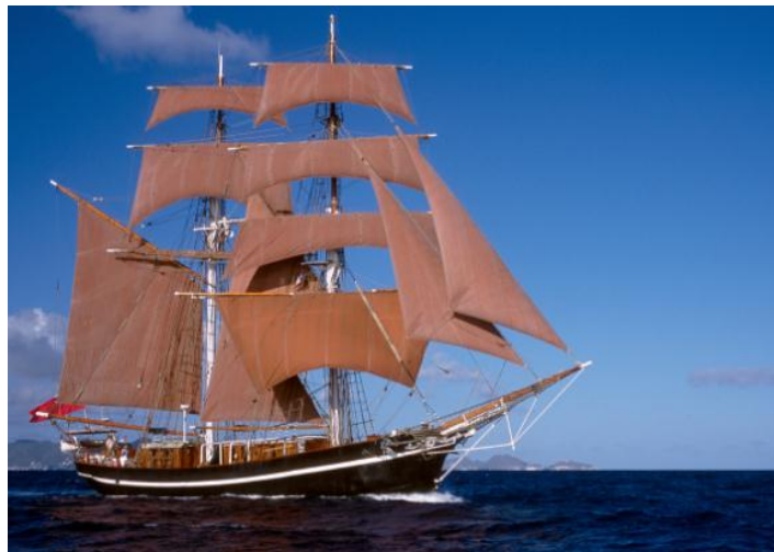
Eye of the Wind