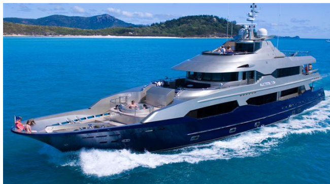
Princess Iluka in 2010

For bookings and further information: www.princessiluka.com.au