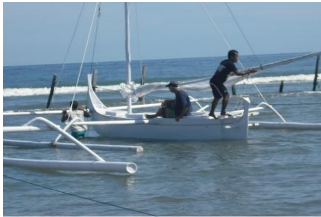
A Sandeq Indonesian boat