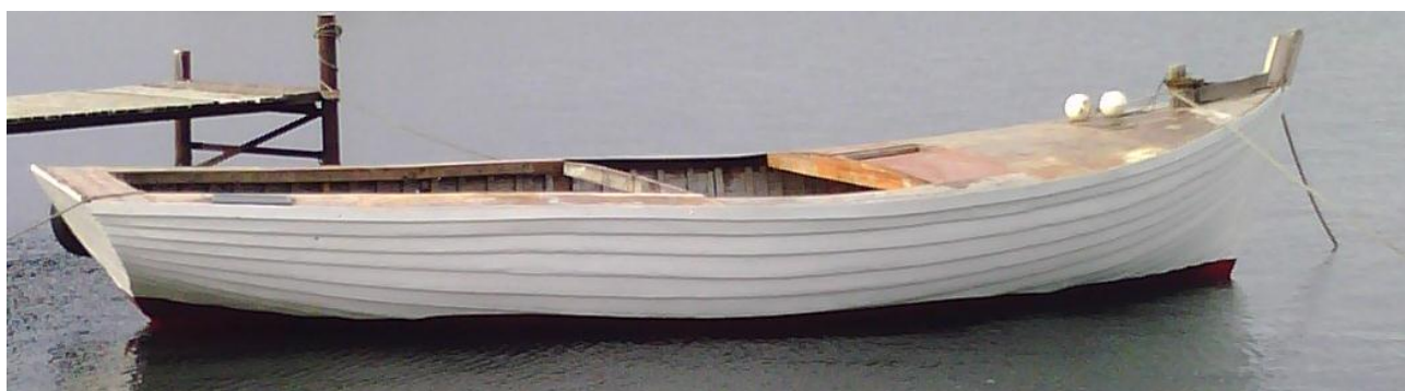
Lillian under restoration, showing her beautiful lines

Six years ago she sank at her mooring from where she was rescued by an enthusiastic group of Vietnam Veterans who took her to Hobart and set about restoring her. She will be a welcome visitor at the 2011 Australian Wooden Boat Festival.